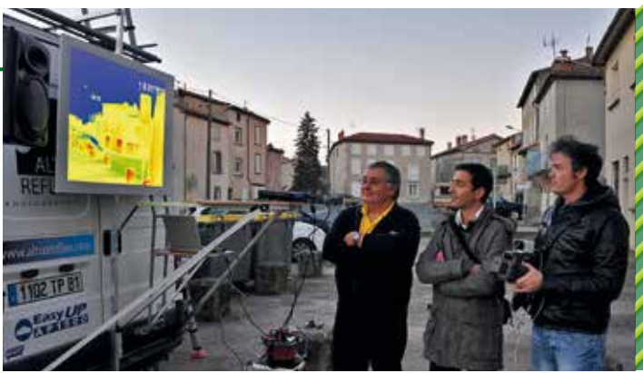
Mobile thermography: a innovative system well adapted to villages, Pôle Albigeois et Bastides (France)

To be labelled CEMR, the establishment of an energy team is necessary. The energy team should comprise 5 to 15 people and involve mayors, counsellors of environment and energy, representatives from the municipal administration, local entrepreneurs and interested citizens and an energy manager. A chairman should be elected from the political level, likely a mayor, technically assisted by the energy manager, the expert and the driving force. Each energy team member is responsible for a certain sector (renewable energy, energy efficiency, mobility, public relations, civic participation, involving schools with energy topics,