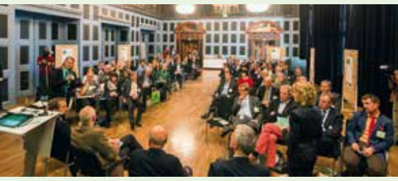
100 % renewable energy regions, annual congress, Kassel, 2014 (Germany)