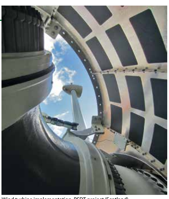
Wind turbine implementation, PSDT project (Scotland)

The 9 MW project, now in construction, consists of 3 Enercon turbines each 145m tall sited at Beinn