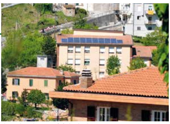
Photovoltaic plant on roof of school (Italy)

The jury has been engaged to exchange on the GHG reduction opportunities in the private and public sector and on the action plan.