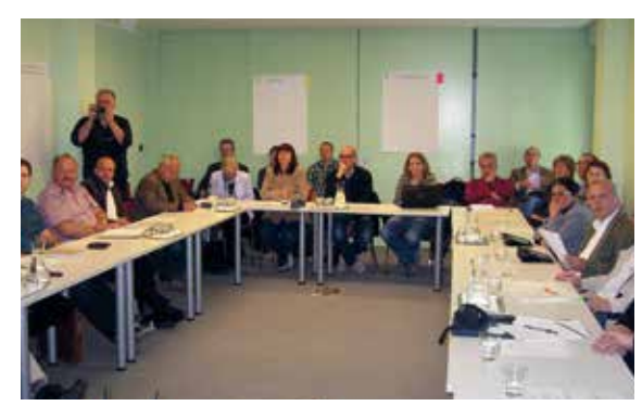
Working seminar, Mirna Valley (Slovenia)

The real work begins once the first actions have been initiated. You have managed to create or strengthen a vibrant dynamic, the first visible results give credibility to your action plan, which fortunately has not produced any counterexample. It is then time to move to a long-term program to become a 100% RES community. At this stage, a detailed diagnosis, backed by a multi-criteria analysis will be valuable to screen the priority actions and their evaluation over time. Before we reach our objective, we must climb the steps, one by one, beginning with the first, that is to say, the mobilization of skills and resources.