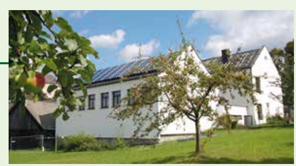
Thermal insulation, School Albrechtsberg (Austria)

The thermal insulation model schools developed in Austria distinguishes itself from a "normal" thermal insulation through higher final energy savings and CO<sub>2</sub>-reductions. Renewable energy installations are implemented and environmental friendly construction material is used. Social targets like higher comfort or a higher living quality are further taken into consideration. The model thermal insulation should also be replicable for other communities.