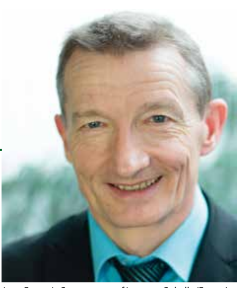
Jean-François Caron, mayor of Loos-en-Gohelle (France)

The "sustainable" job creation is the focus of your