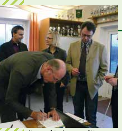
Signing of the Covenant of Mayors

As of August 2014, from Merano to Lampedusa, more than half of the 5,400 European Municipalities participating to the Covenant were Italian. These numbers have been reached due to the extraordinary involvement of supra-municipal governments and of numerous initiatives and campaigns similar to the Covenant of Mayors.