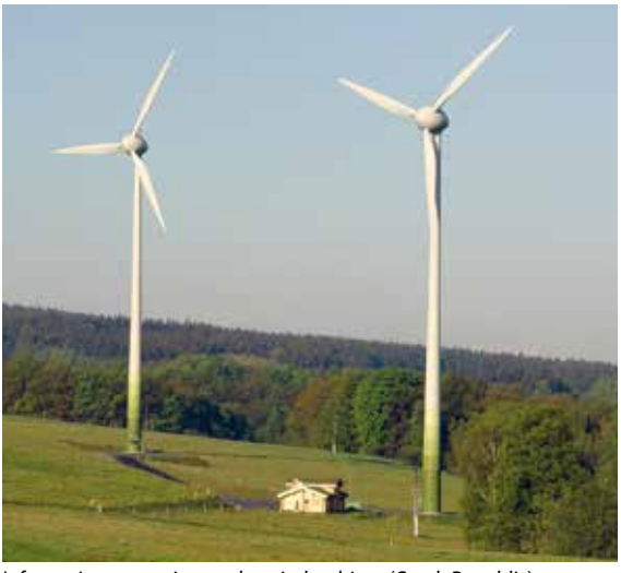
Information center, just under wind turbines (Czech Republic)

Jindřichovice is trying to attract prospective new-comers who are looking for a good living environment. Since 2008, ten low-energy houses with heat pumps (58 kW) have been built, either with solar thermal installation or green roof. An Environmental Information Centre located near the wind farm offers guided tours for individuals and groups, including programs for schools. Municipal loans and subsidies (3600 EUR/year) have been provided to private RES installations for the last 10 years.